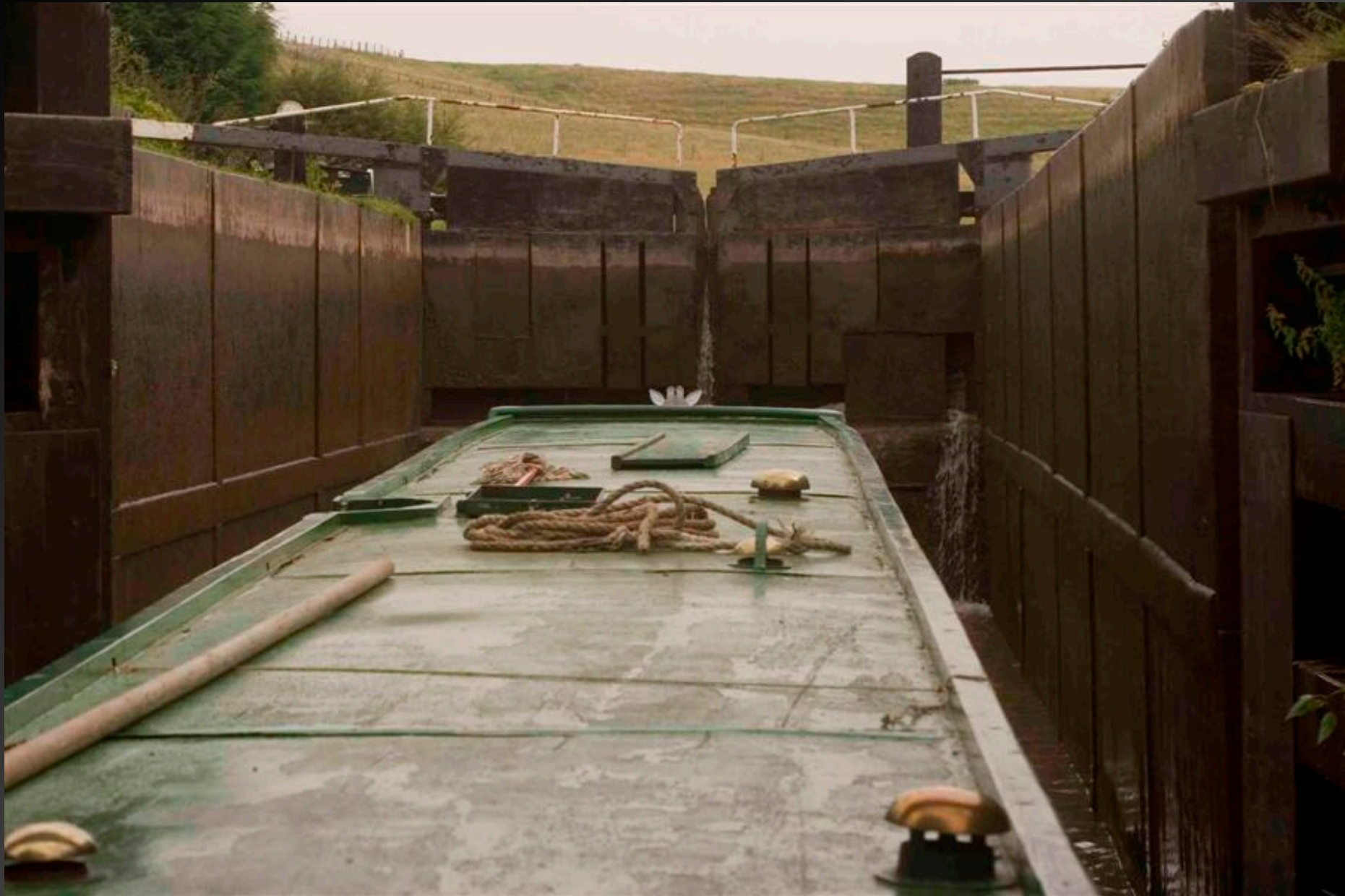
Beeston Steel Lock, Shropshire Union Canal