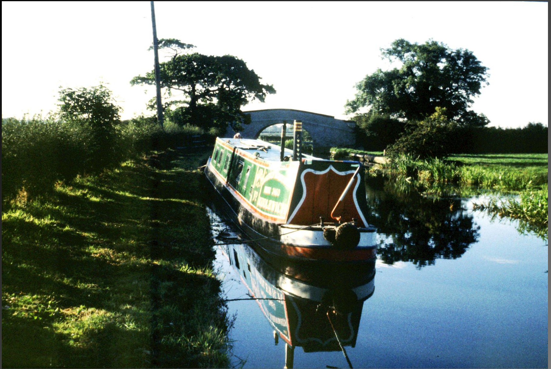
Shropshire Union, Ellesmere Port