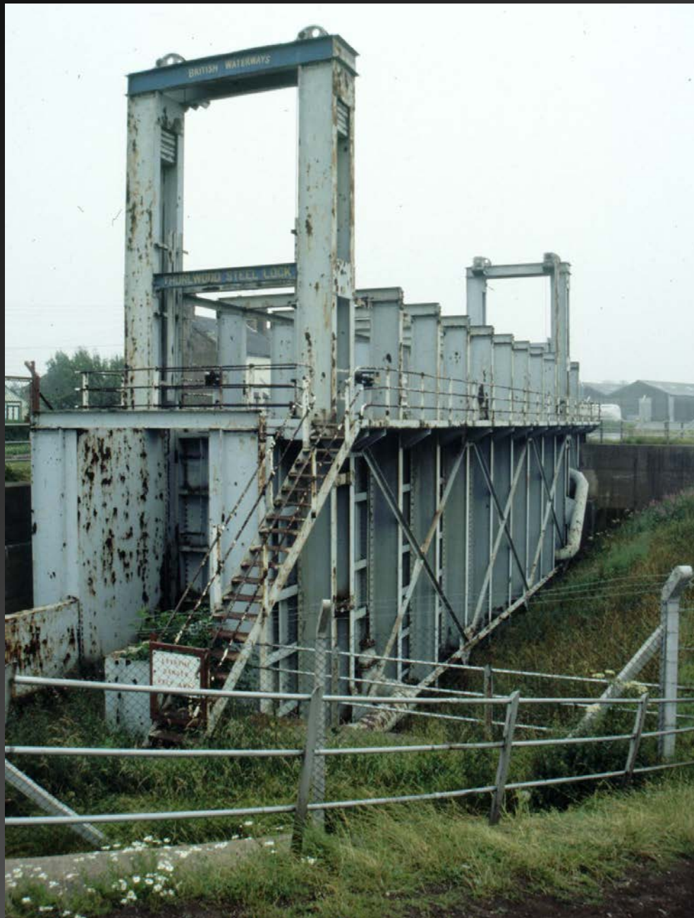
Trent & Mersey Canal, Thurlewood Steel Lock