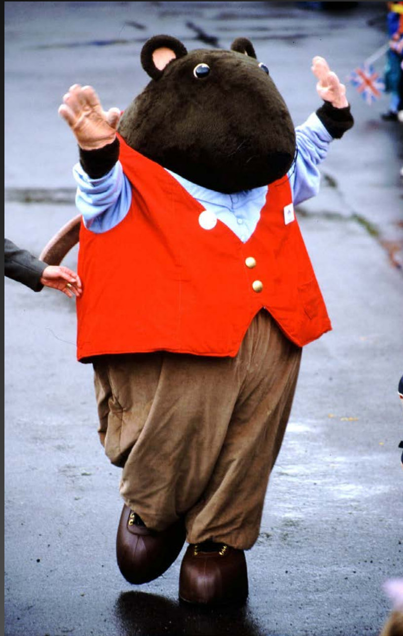
Huddersfield Narrow Canal, Tunnel End