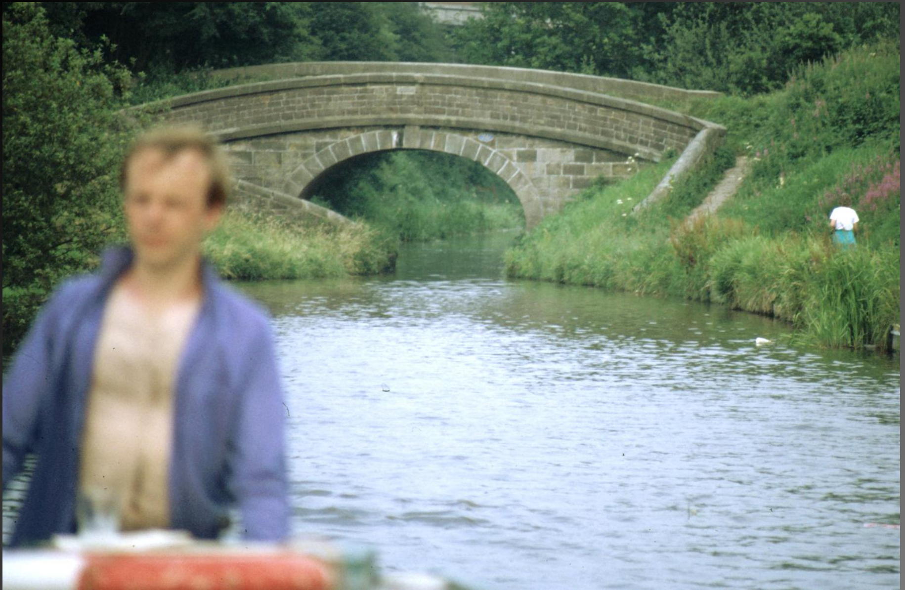
Peak Forest Canal, Roving Bridge