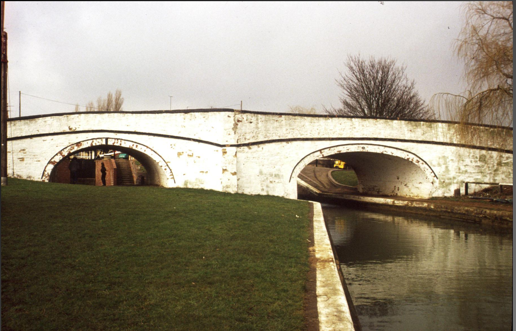
Grand Union Canal, Stoke Bruerne