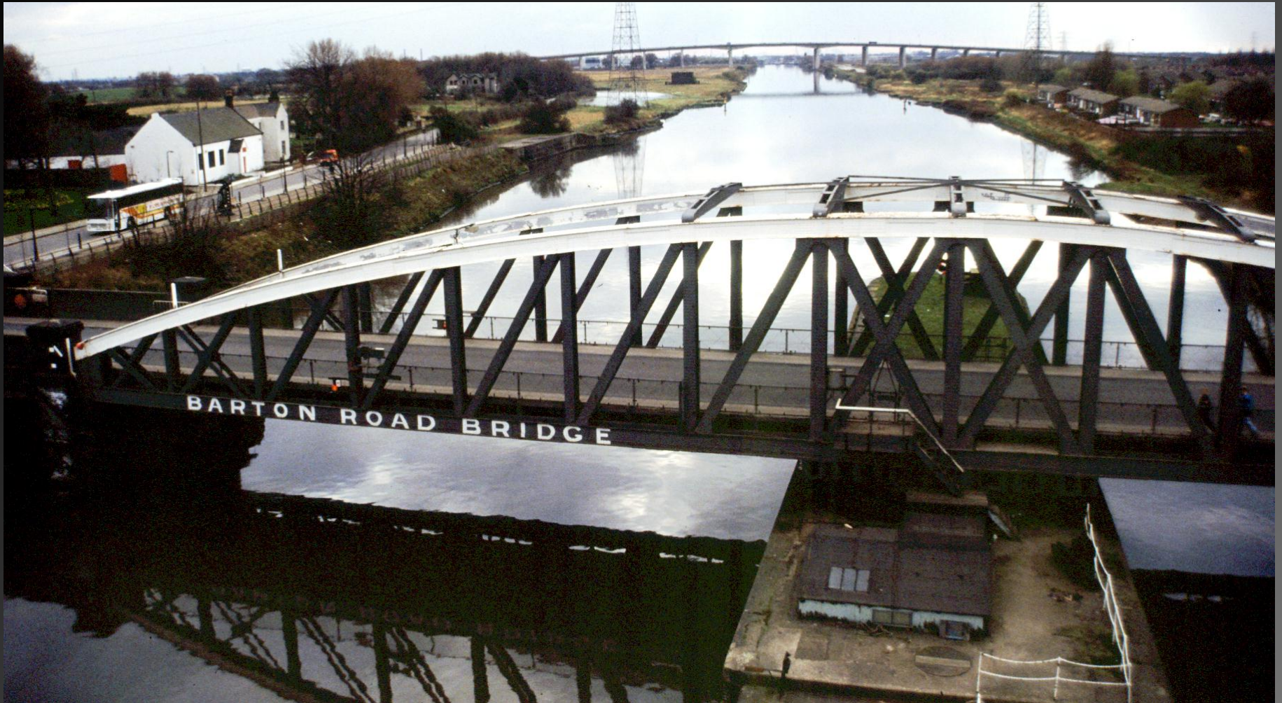
Bridgewater Canal, Manchester Ship Canal, Barton Swing Bridge