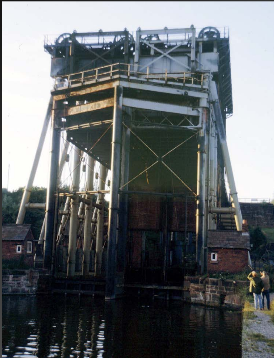
Weaver Navigation, Trent & Mersey Canal, Anderton Lift