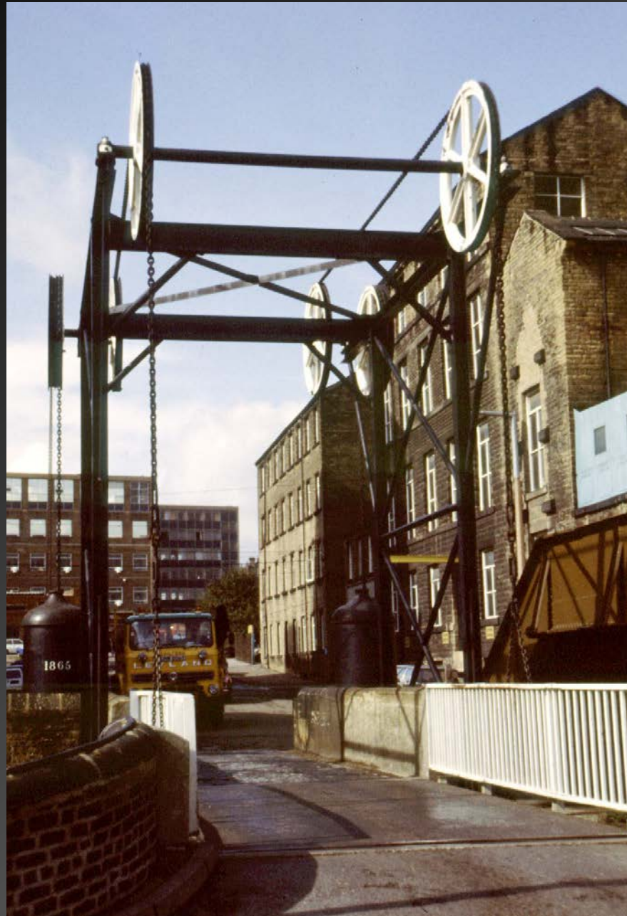
Huddersfield Broad Canal, Locomotive Bridge