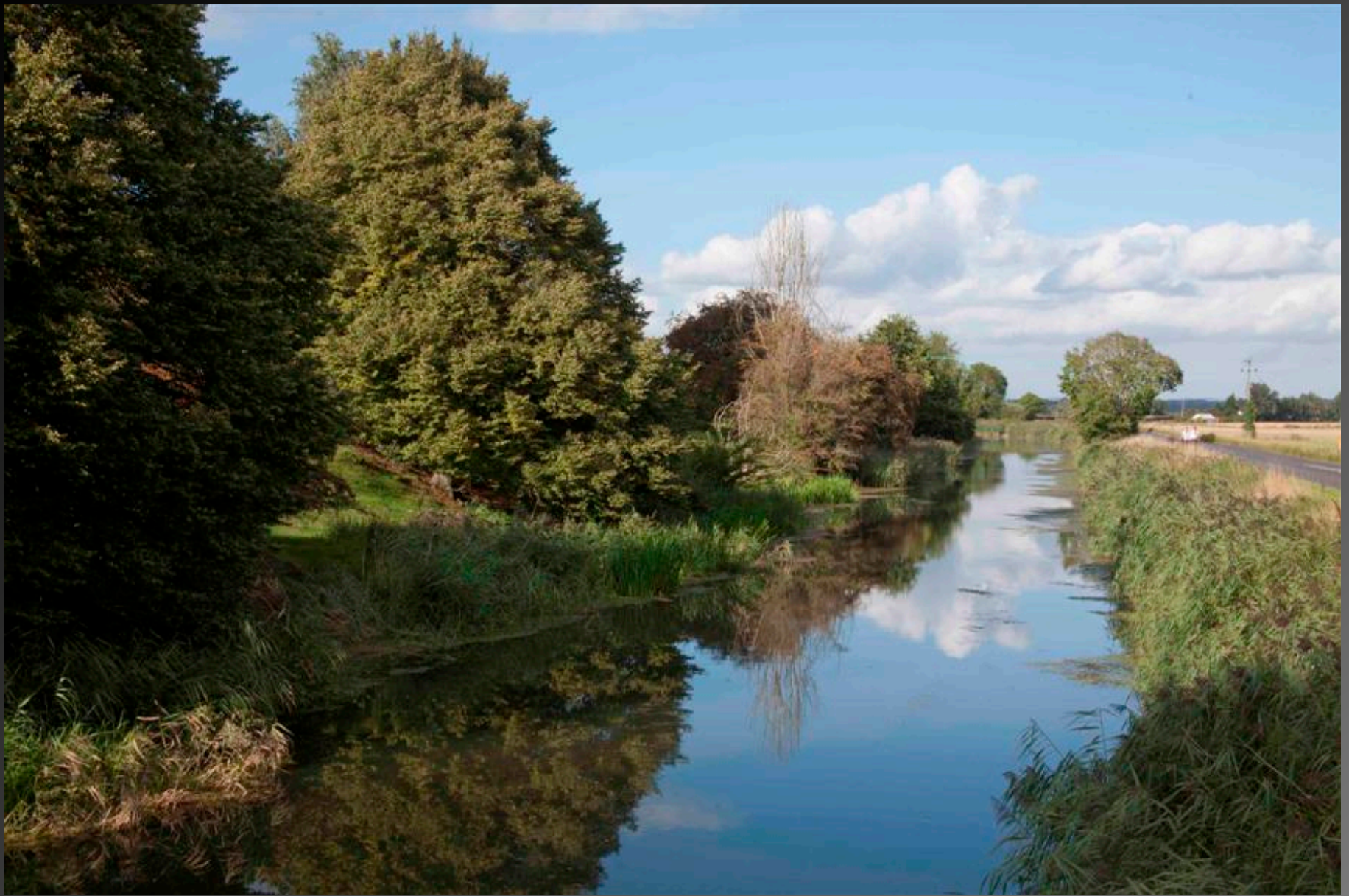
Royal Military Canal – Romney Marsh, Kent