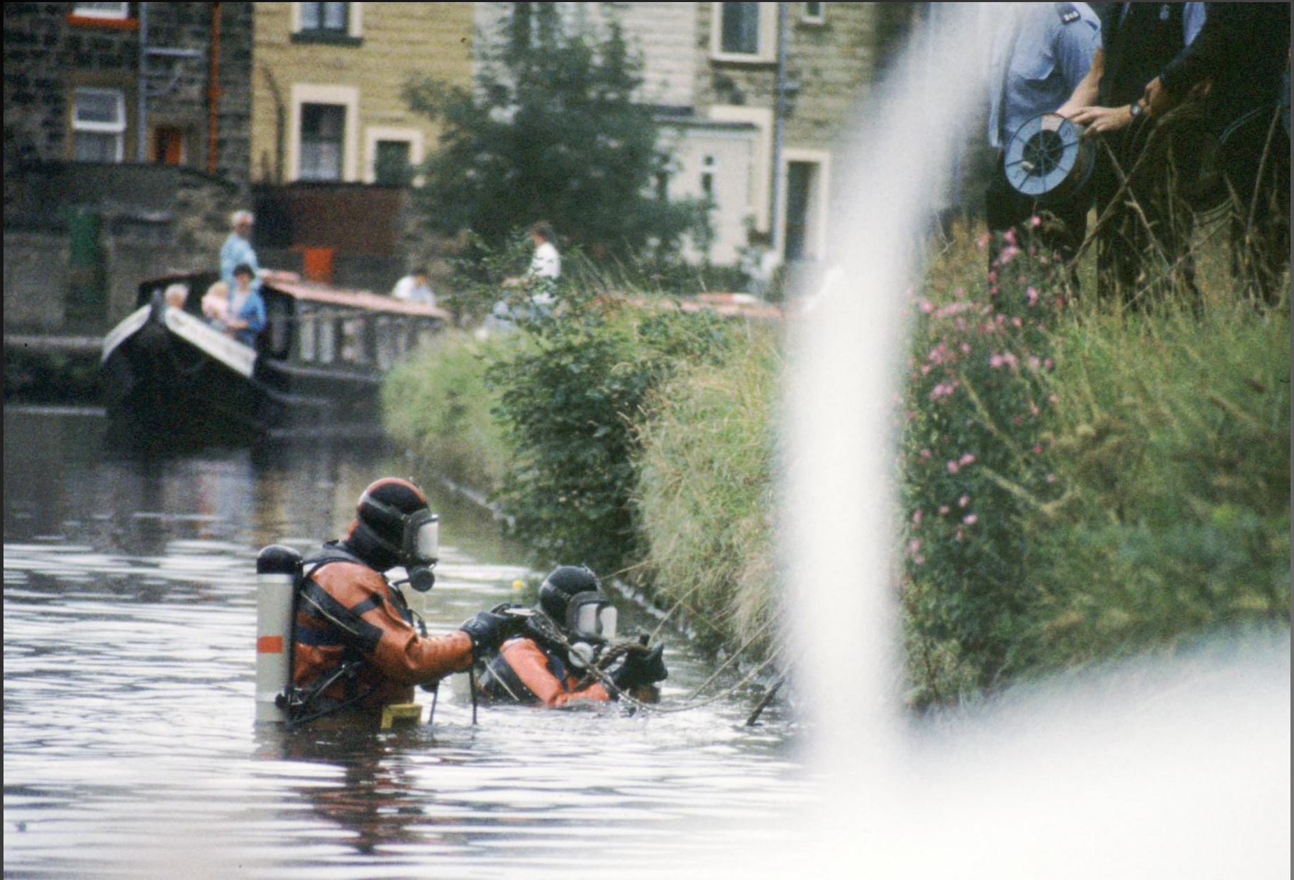
Leeds And Liverpool Canal, Burnley