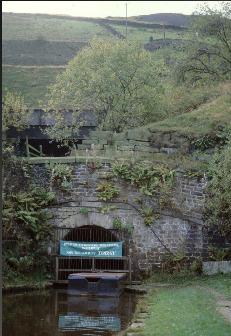
Huddersfield Narrow Canal, Standedge Tunnel