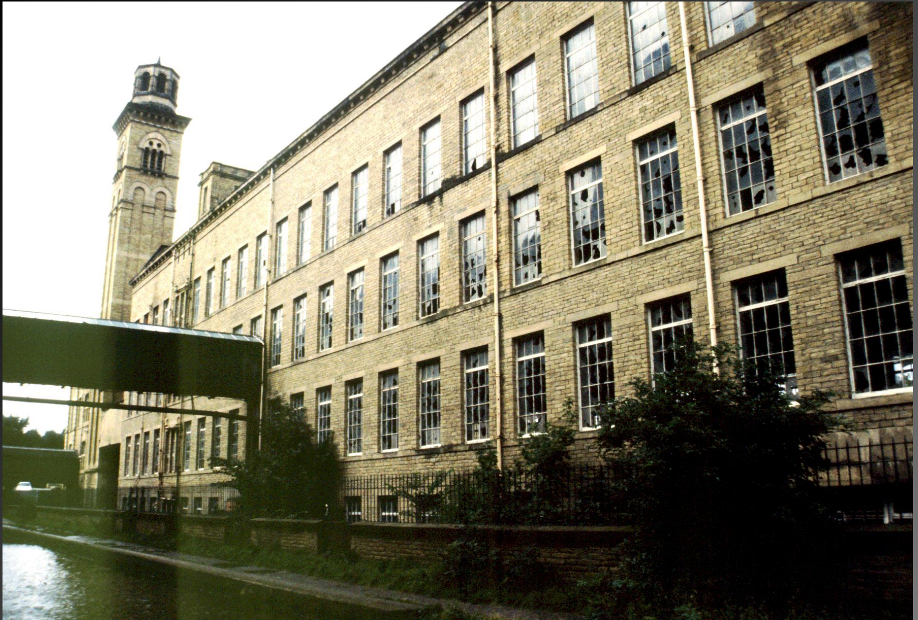
Leeds And Liverpool Canal, Saltaire