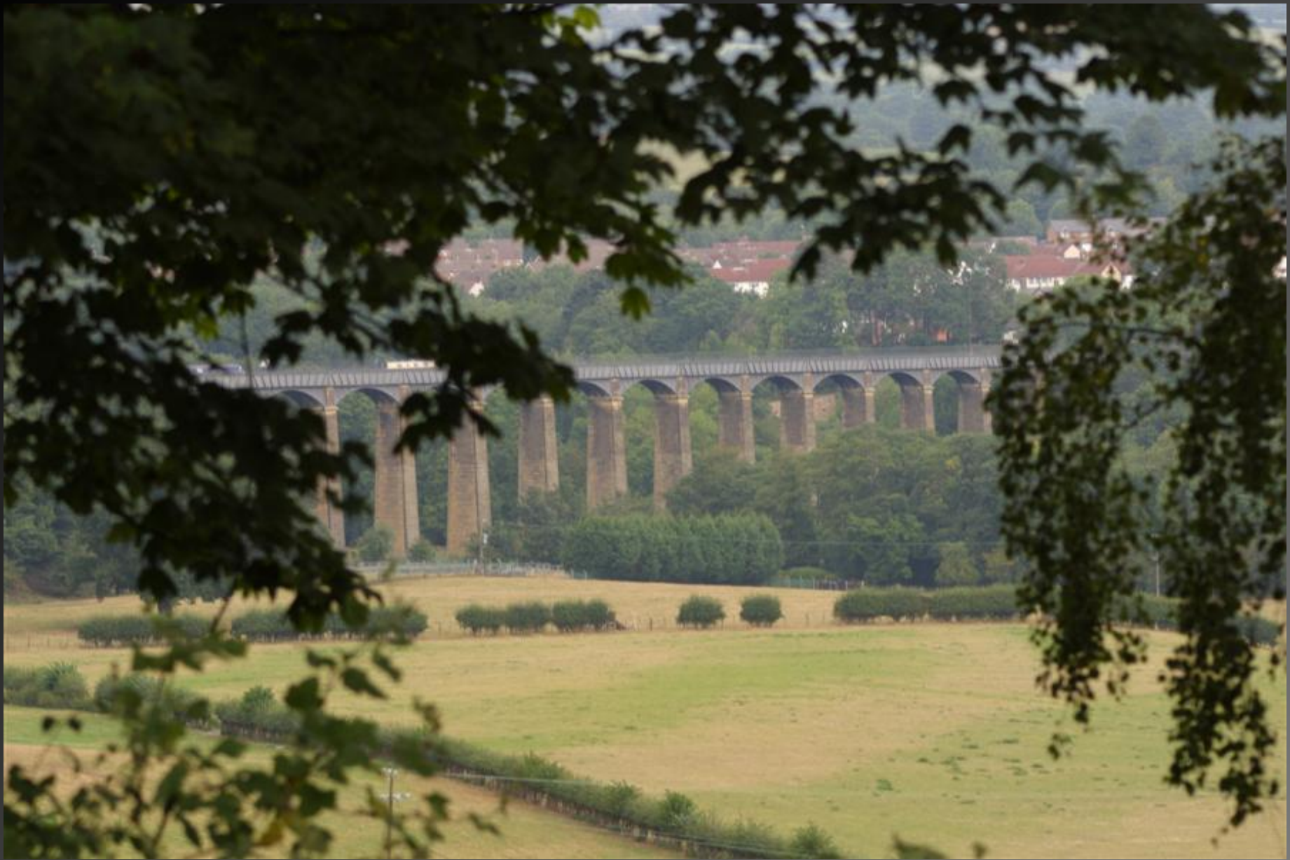
Llangollen Canal, Pontcysyllte Aqueduct