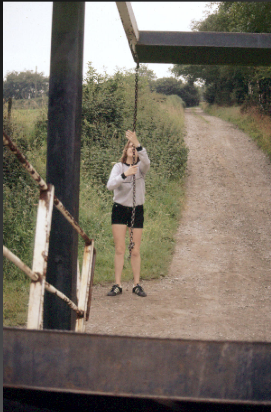
Llangollen Canal, Opening Lift Bridge