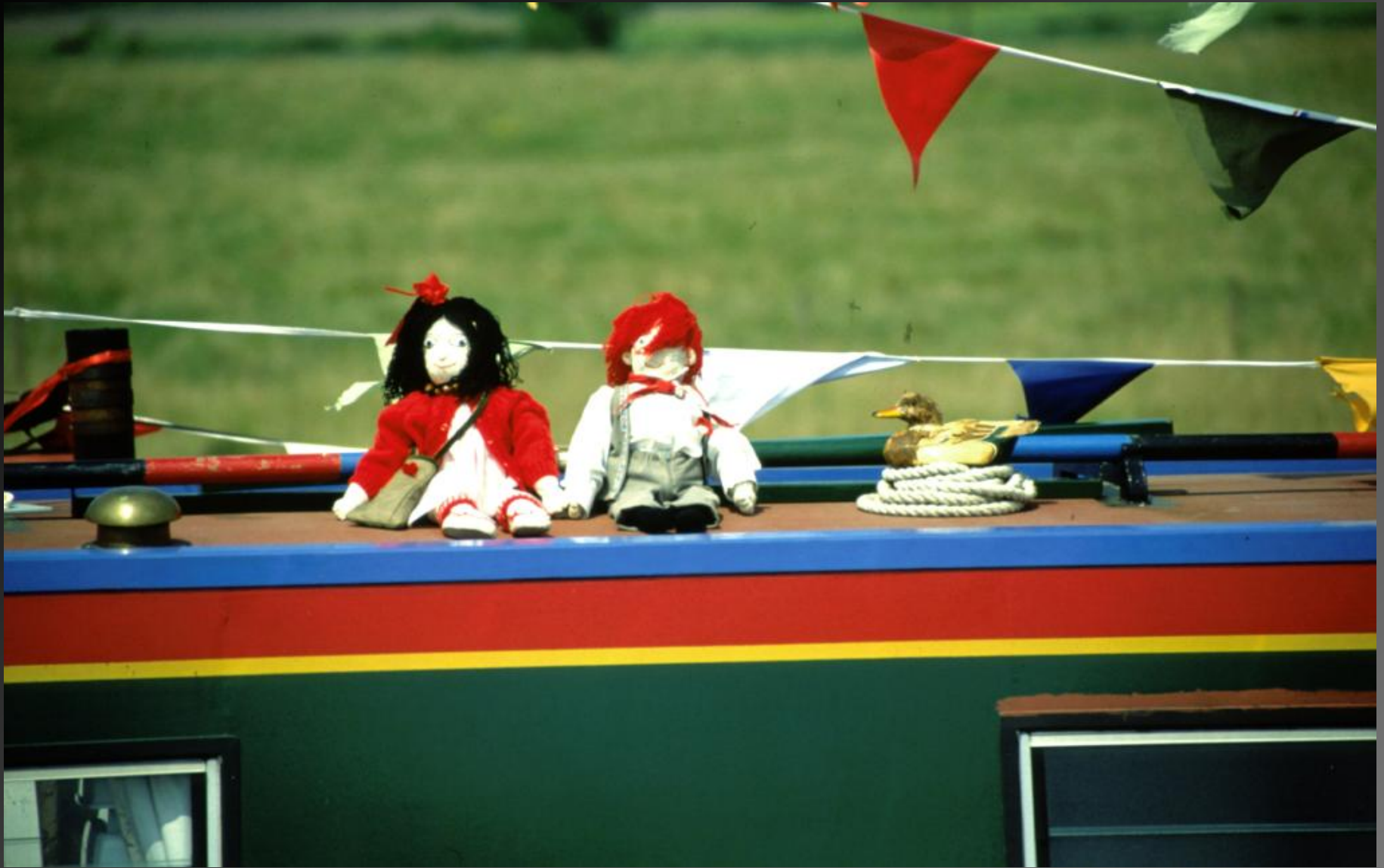
Rosie & Jim ..... & Duck