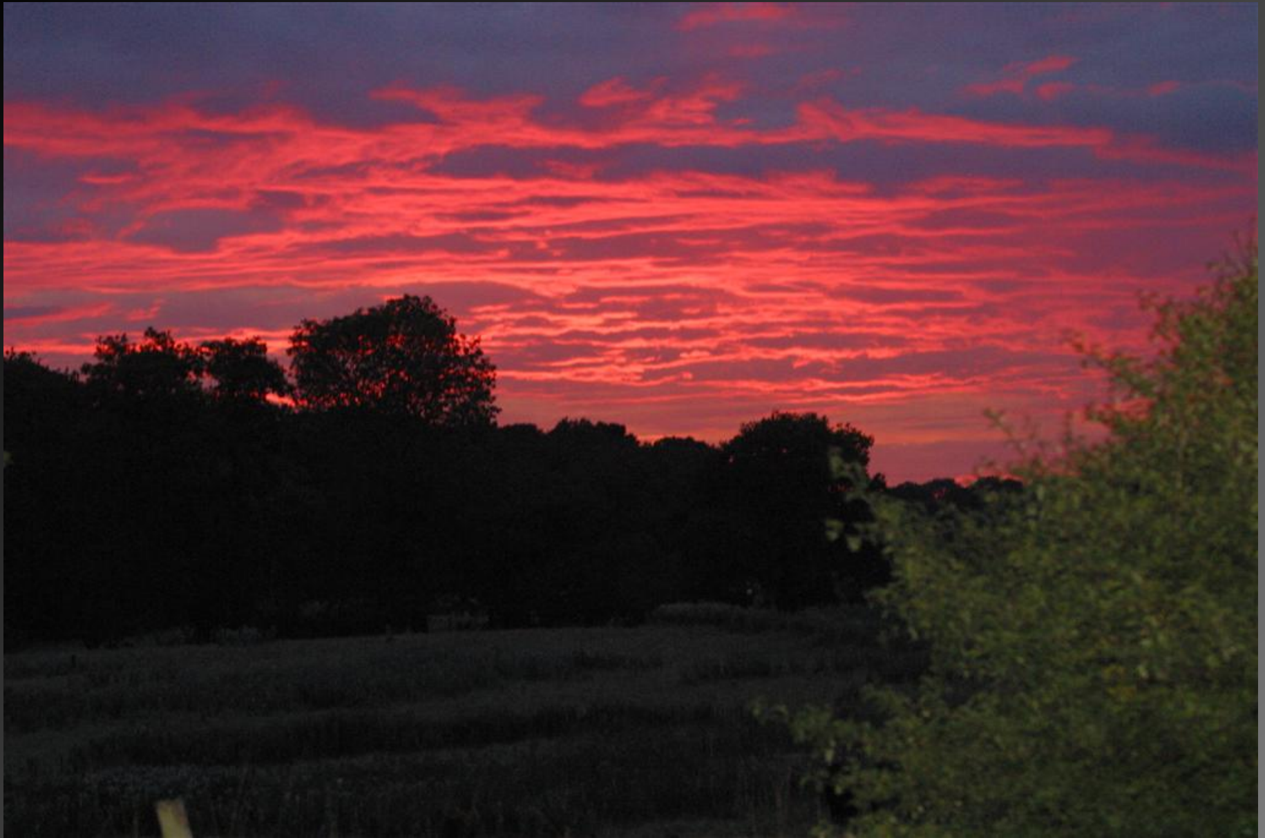
Sunset on the Shropshire Union