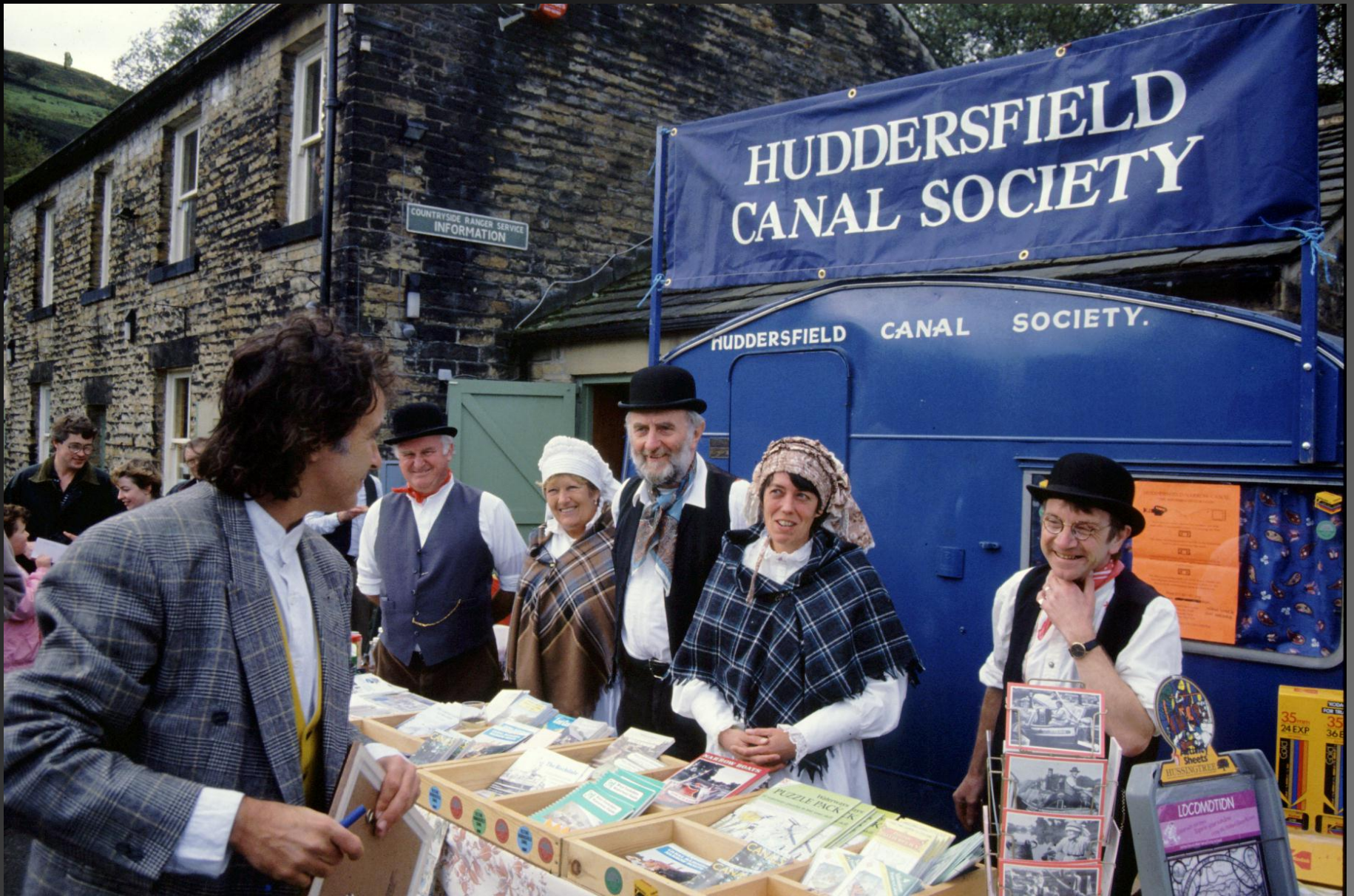
Huddersfield Narrow Canal, Tunnel End