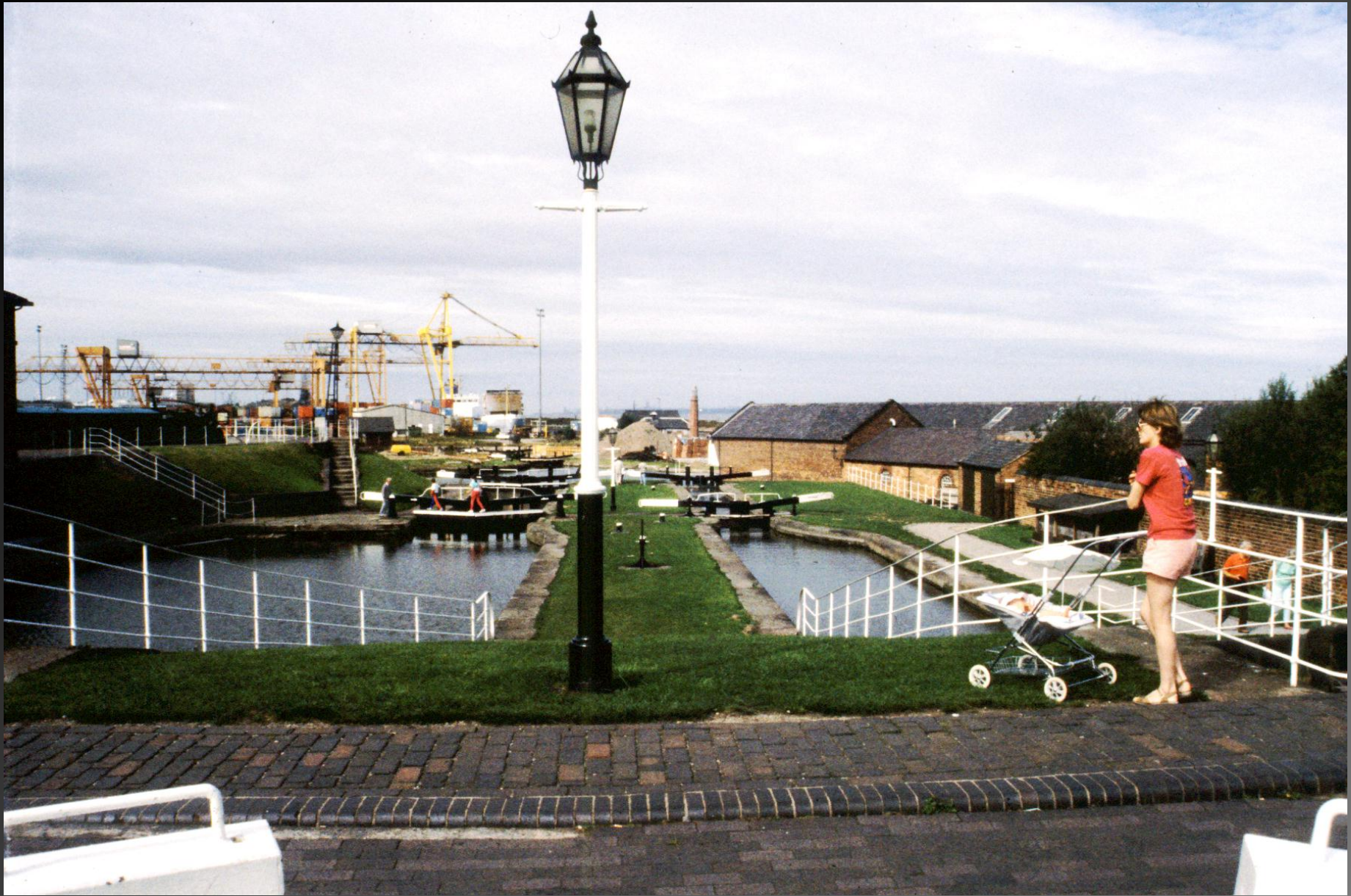
The Boat Museum, Ellesmere Port