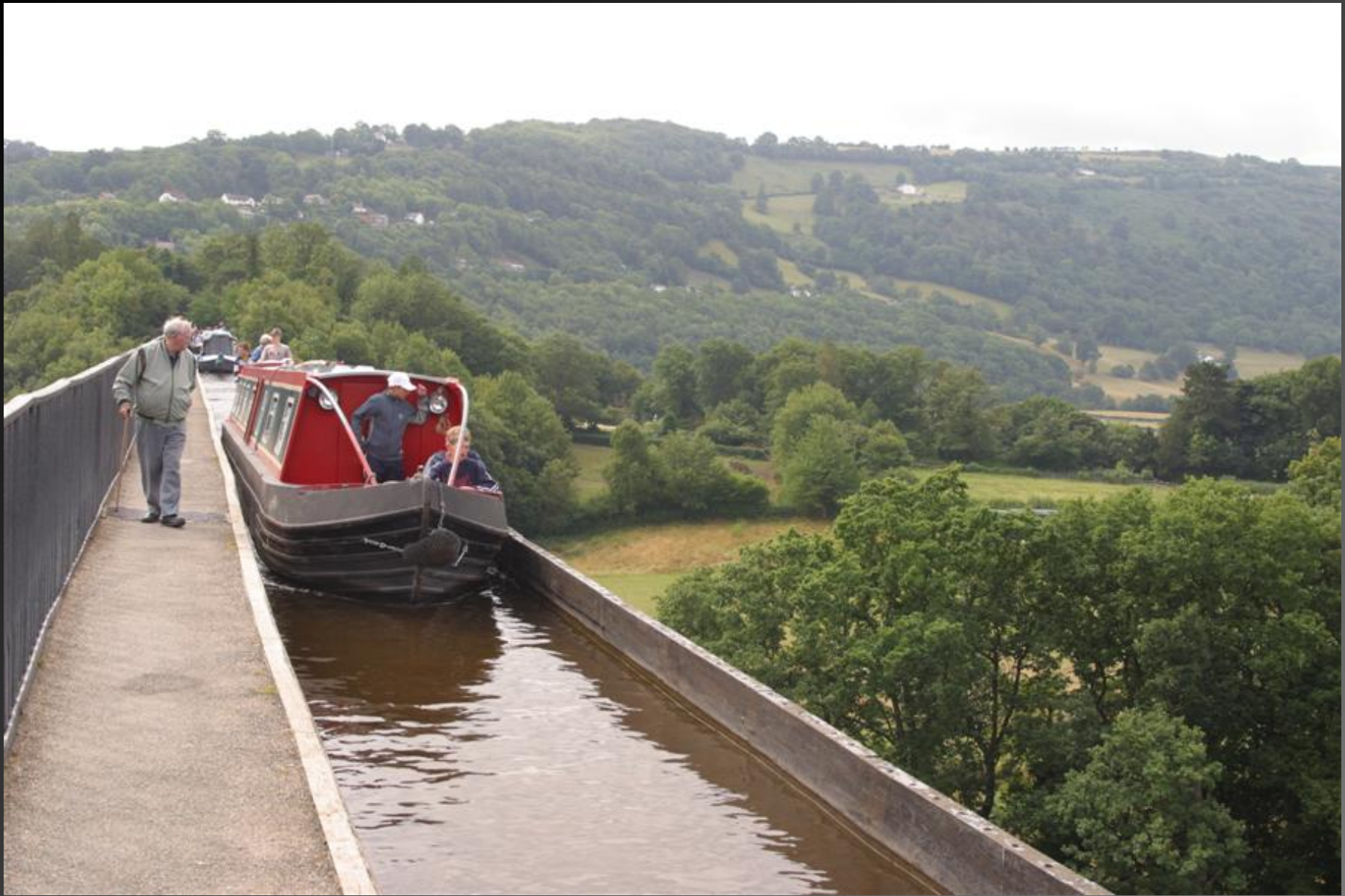
Llangollen Canal, Pontcysyllte Aqueduct