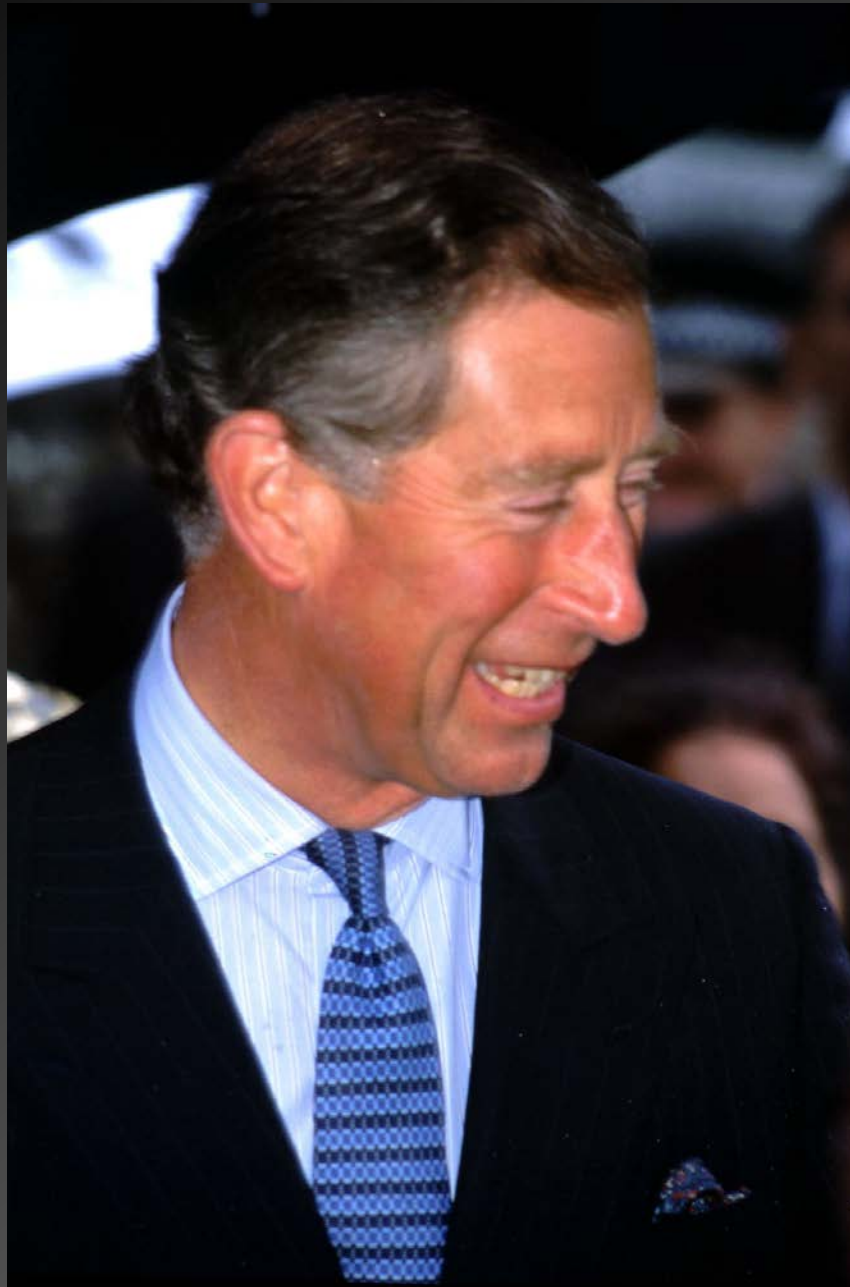
Huddersfield Narrow Canal, Tunnel End