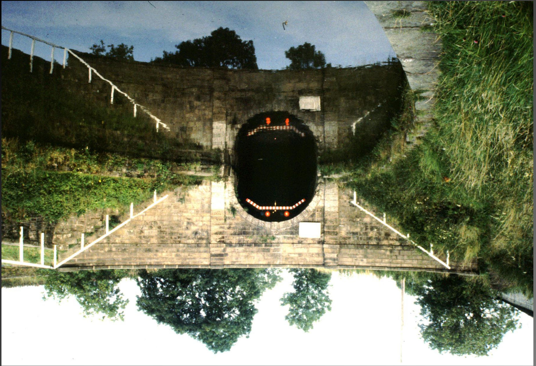
Leeds And Liverpool Canal, Foulridge Tunnel