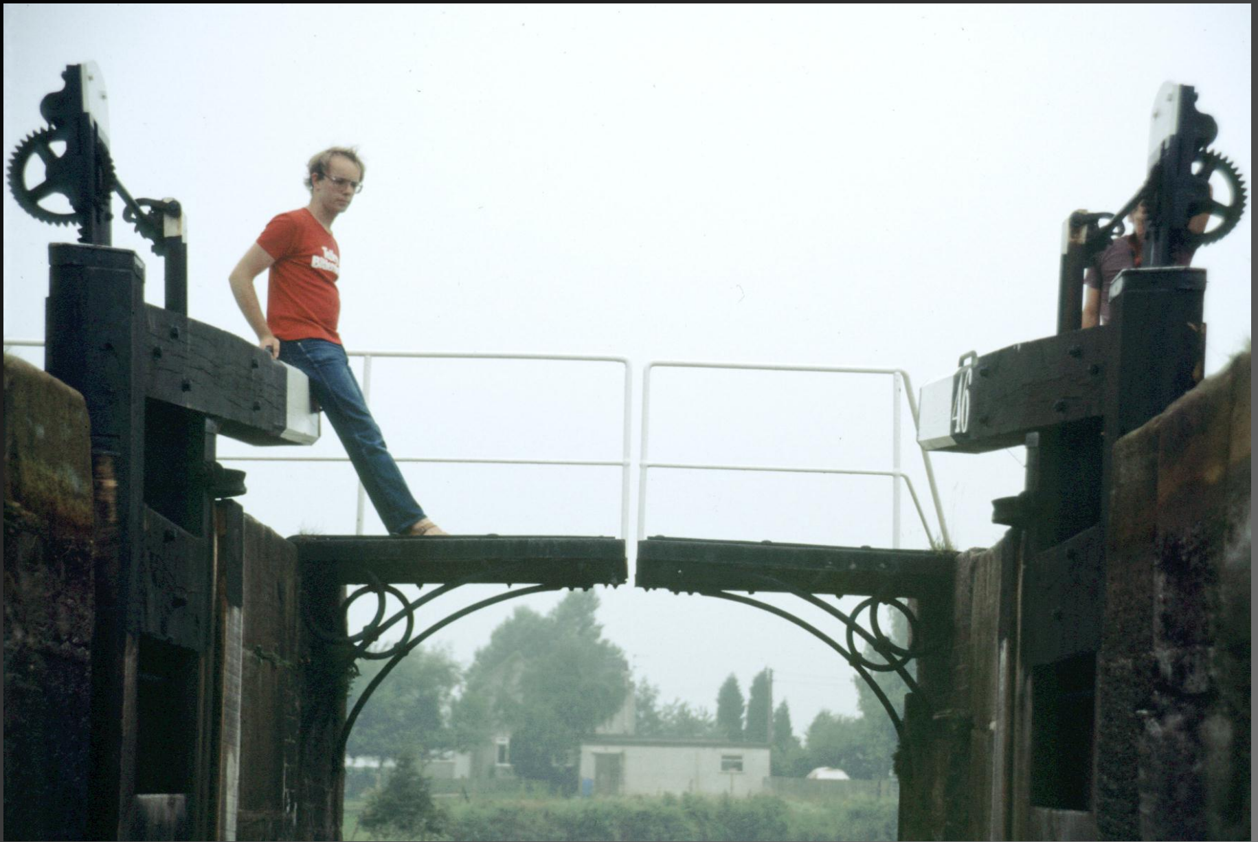
Trent & Mersey Canal, Split Bridge