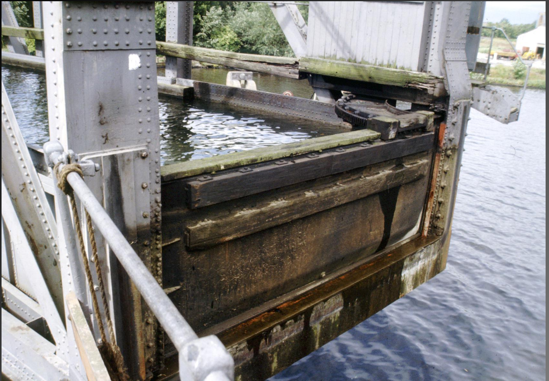
Bridgewater Canal, Manchester Ship Canal, Barton Swing Bridge