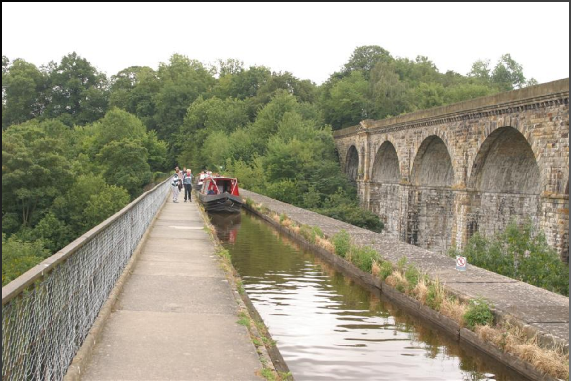
Chirk – Aqueduct & Viaduct, Llangollen Canal