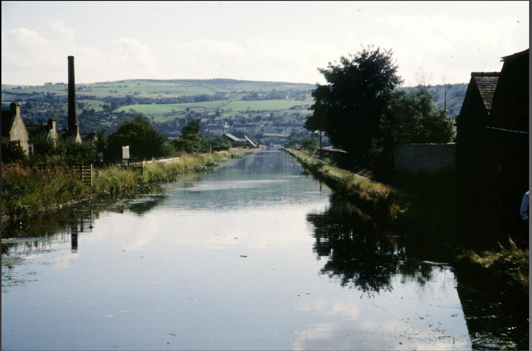
Leeds And Liverpool Canal, Burnley Embankment