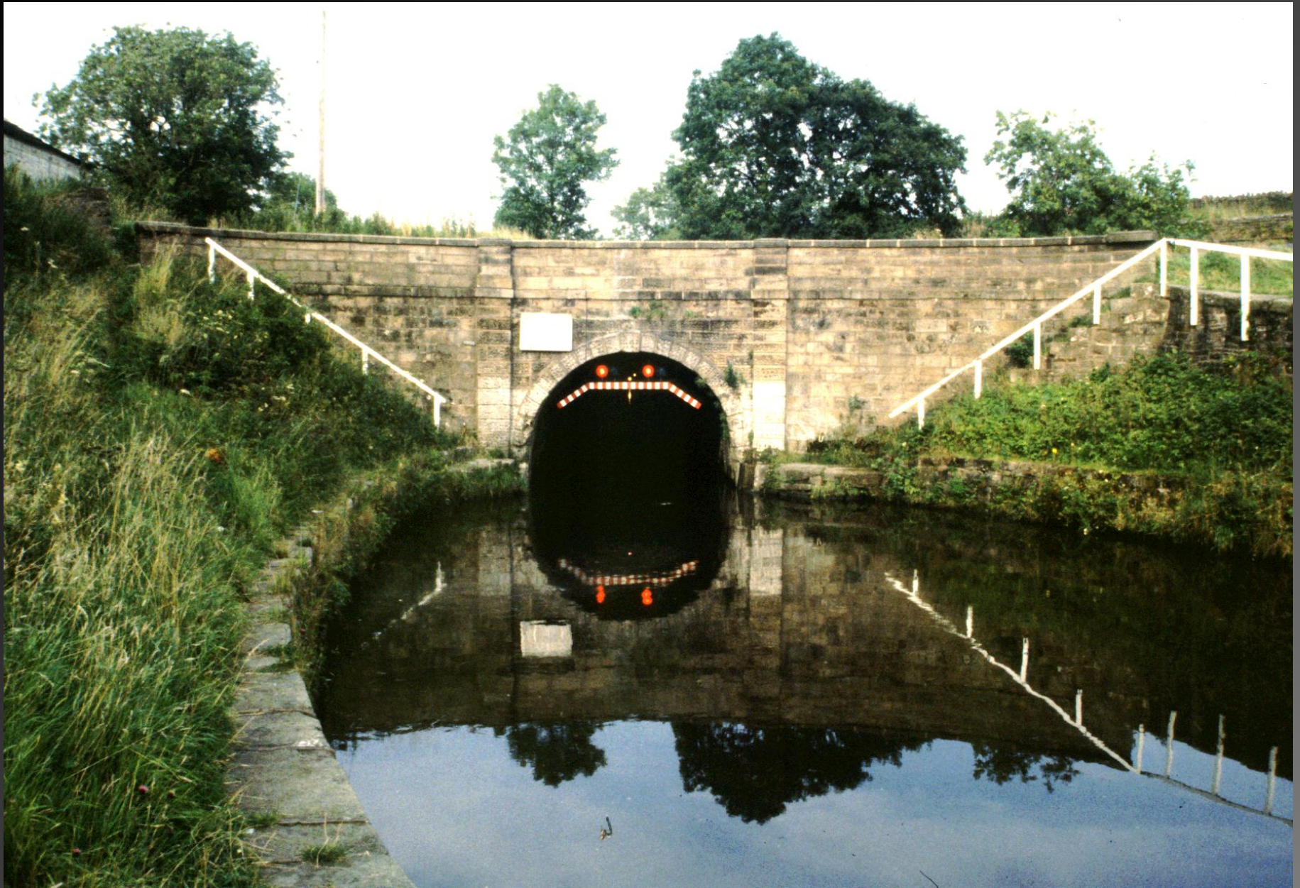
Leeds And Liverpool Canal, Foulridge Tunnel