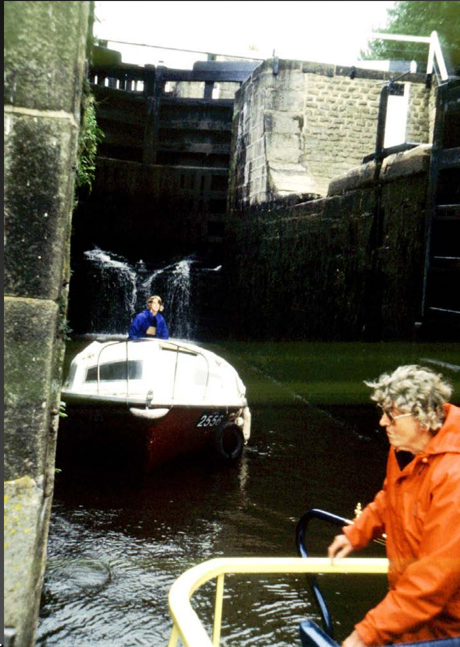
Leeds And Liverpool Canal, Bingley 3-rise Locks