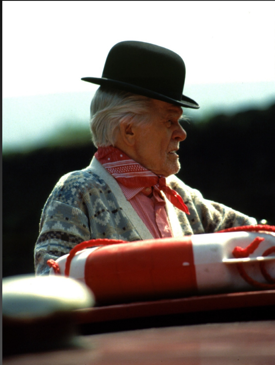
Huddersfield Narrow Canal, Tunnel End