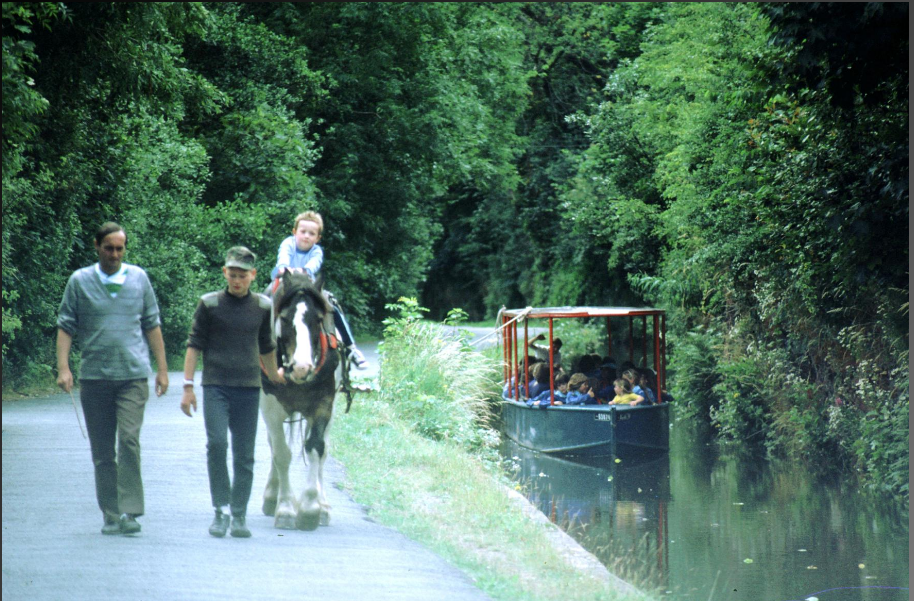
Llangollen Canal, feeder branch