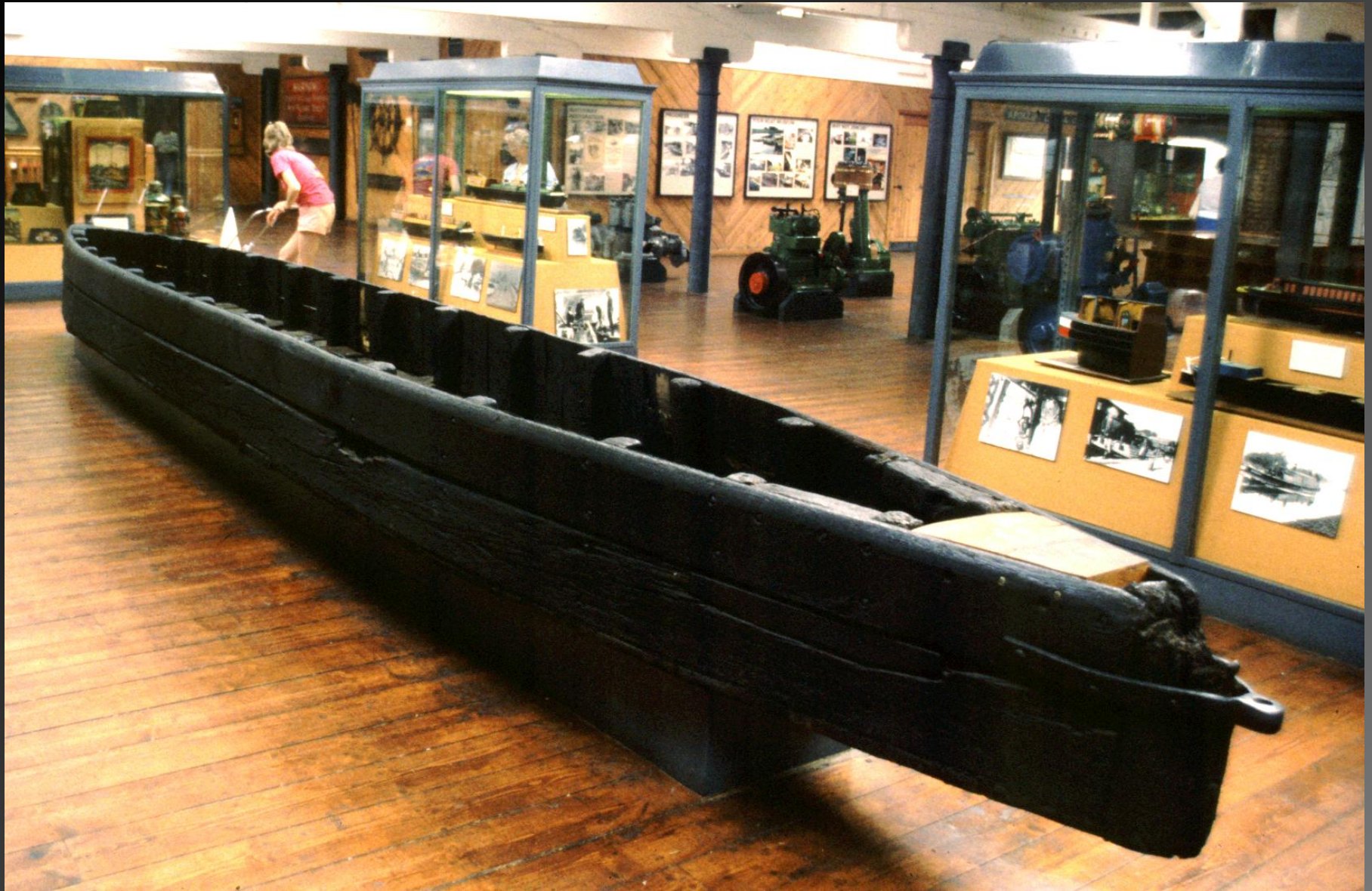
A 'Starvationer', An Early Container 'Boat', The Boat Museum, Ellesmere Port