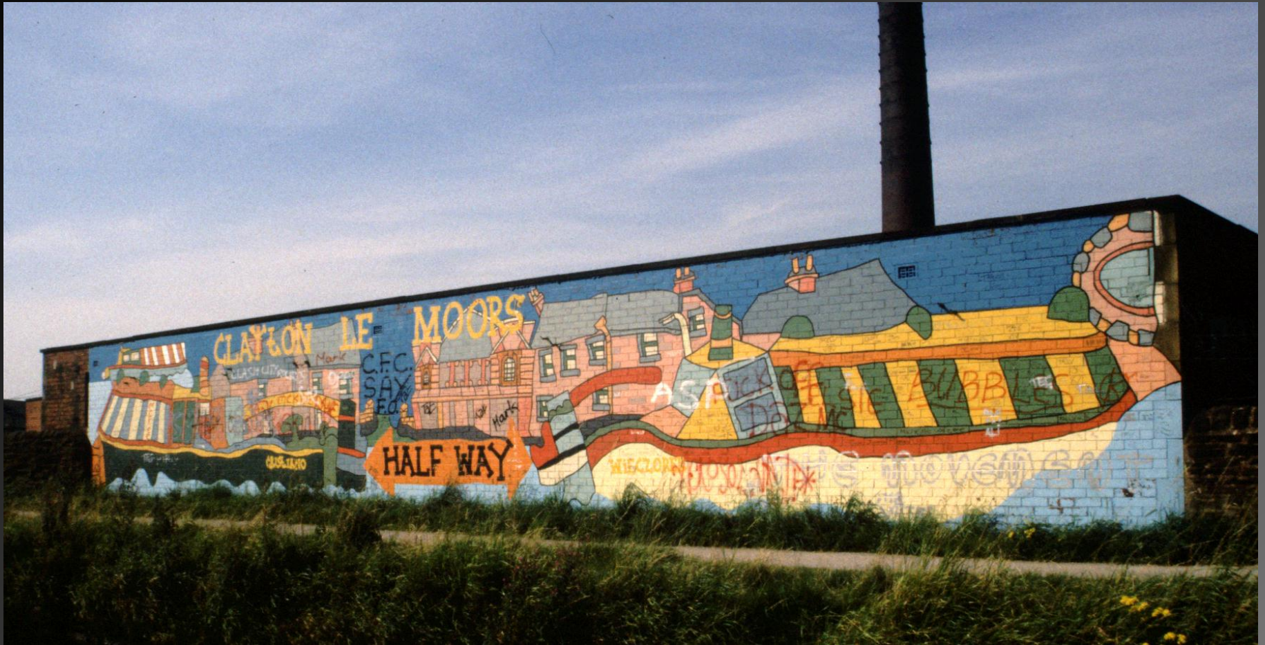
Leeds And Liverpool Canal, Clayton-Le-Moors